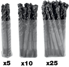
x5 x10 x25