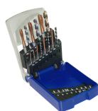
Set of 5 HSSE PM TiCN IT2 stainless steel taps + 5 HSSE TBX 561 drills for through holes