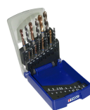
Set of 5 HSSE PM TiCN IT5 stainless steel taps + 5 HSSE TBX 561 drills for blind holes